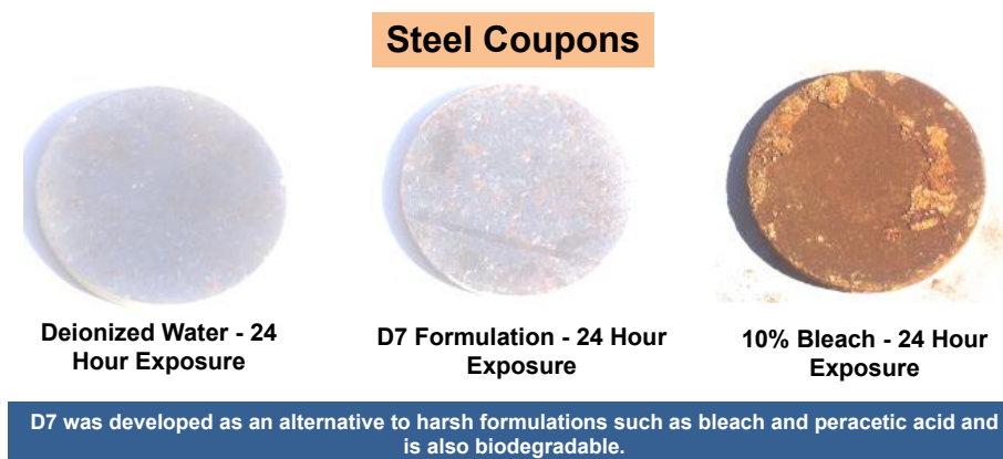
Figure 2: Comparison of the corrosion of D7 vs. 10% chlorine bleach on steel coupons.

An ideal disinfectant for field applications should have low toxicity and low corrosivity properties so that it does not harm people or property and it should be biodegradable so it does not harm the environment. In addition, an ideal disinfectant should have low odor and off-gassing properties after application so an area can be quickly re-occupied and re-used after operations are complete. Unfortunately, many disinfectants such as those that contain chlorine compounds (e.g., sodium hypochlorite [chlorine bleach], hypochlorous acid, sodium dichloroisocyanurate [dichlor], sodium trichloroisocyanurate [trichlor], and chlorine dioxide) and those that contain peracetic acid are often toxic, corrosive, and give off strong odors during and after application. These types of disinfectants may require rinsing and/or long ventilation times after use before personnel can re-occupy the area. D7, however, is very different. The mild ingredients in D7 give it very low toxicity and corrosivity properties and it is odor-free after application making it safe for people and property. D7 is also biodegradable so it does not harm the environment. An example of the difference in corrosion properties between D7 and 10% chlorine bleach is shown in Figure 2.