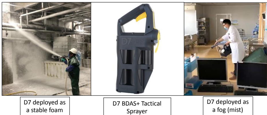
Figure 3: Multiple deployment for D7 make it highly effective for many scenarios

Finally, D7 can also be deployed by wetting microfiber towels and wiping touch points (e.g., door knobs, hand rails, escalator rails, etc.) where SARS-CoV-2 likely resides. Once D7 comes into contact with the virus, either in the air or on surfaces, it is quickly destroyed reducing the risk of infections to people in the area and reducing the potential for fomite transport. Most importantly, when D7 is deployed using any one of these methods, it eliminates SARS-CoV-2 even when it is embedded in soil, organic material, and bodily fluids which renders other disinfectants ineffective.